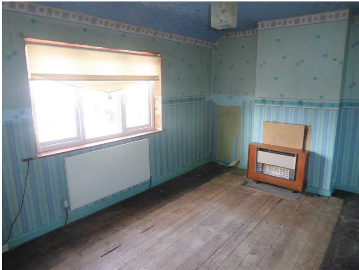
Front aspect double glazed window, radiator, built-in cupboard.