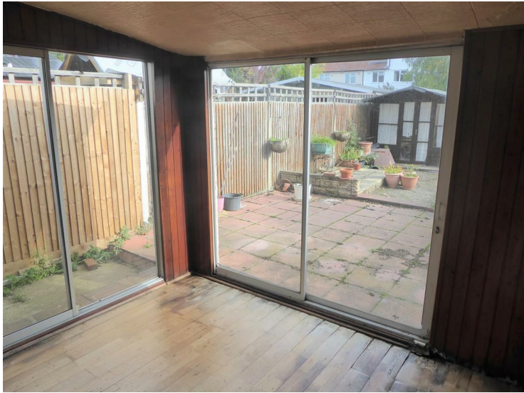
Sliding doors to garden.