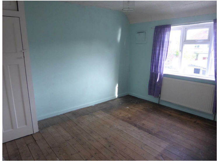
Rear aspect double glazed window, radiator, built-in cupboard.