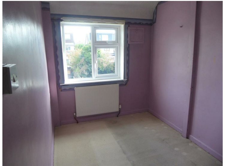
Rear aspect double glazed window, radiator.